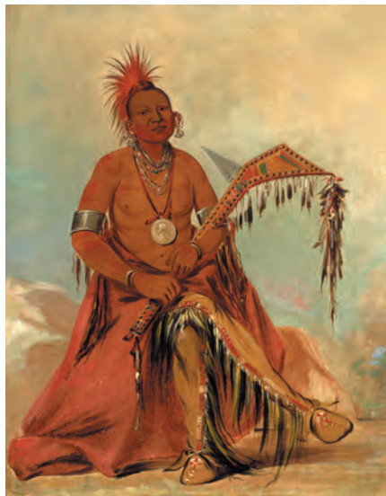
George Catlin, Cler-mónt, First Chief of the Tribe, 1834, oil on canvas, Smithsonian American Art Museum.

Chief Claremore’s legacy also lives on in the town of Claremore, Oklahoma, a place that bears his name in honor of his leadership and dedication to his people. This town serves as a testament to the enduring Osage presence in the region and a reminder of the struggles and triumphs of the Osage Nation.