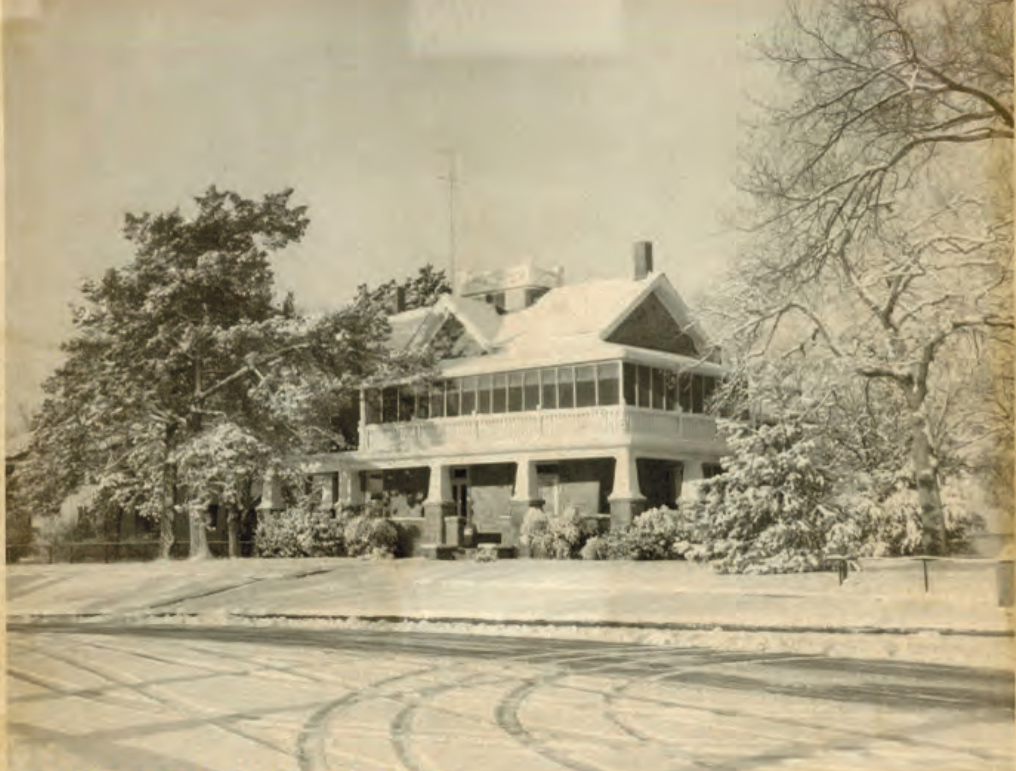
OSAGE SUPERINTENDENT'S Home