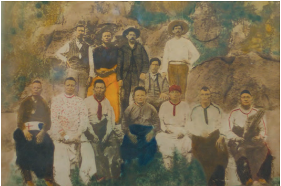
St. Paul Trip, A photo of one of the first Osage Tribal Councils. This photo can be found at the Osage Mission-Neosho County Museum in St. Paul, Kansas.

There are also a number of educational programs and events that take place throughout the year, including lectures, workshops, and celebrations. If you are planning a visit to the Osage Nation Reservation, the ONM should be at the top of your list of places to see.